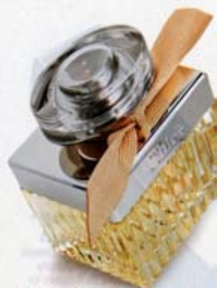
CHLOË PERFUME is a timeless floral blend that wears well in winter