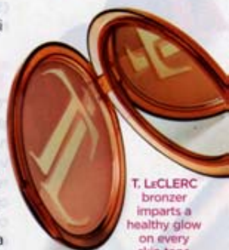
T. LeCLERC bronzer imparts a healthy glow on every skin tone