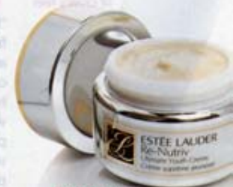
ESTÉE LAUDER cream keeps your skin hydrated and your cells healthy