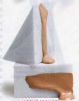
ALCONE SPONGES give you a seamless finish—and are reusable!