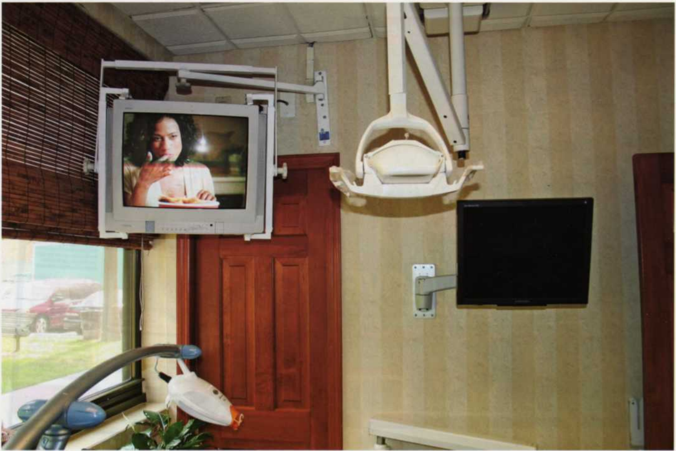
TV and computer monitors are present in each operatory to provide for the patient's educational and entertainment needs during treatment.