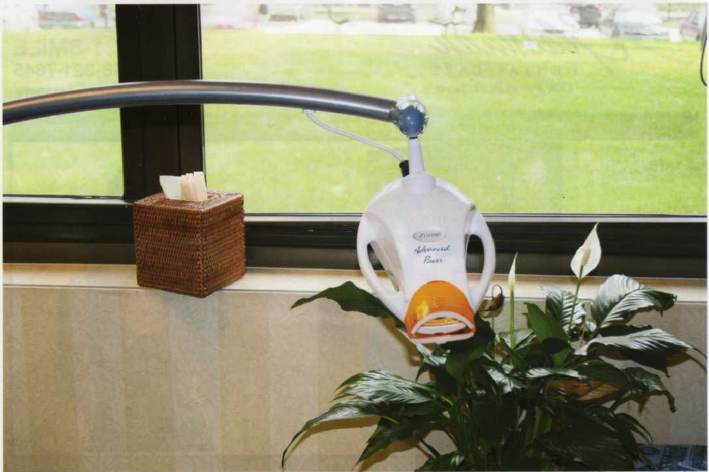
With the Zoom! whitening system, a patient can have teeth that are on average eight shades whiter in about the time it takes to have a Quarter Pounder with fries and a thick shake.