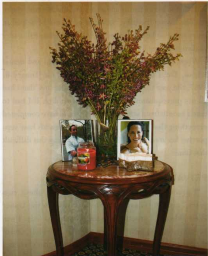
Personal photos of the doctors and scented candles greet each patient as they walk in for treatment.